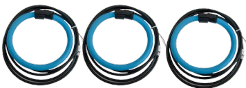
3 Rope Current Transformers (MCS-ROCOIL-CT)